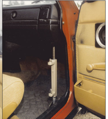
The permanent lift console is the only visible part in the car when the lift is not in place.