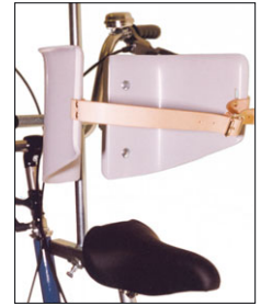
PVC back shield with strap