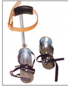
Foot plates w. straps and calf support

Cradled handlebar Back brace with strap PVC back shield with strap Foot plates with straps Foot plates with straps and calf support Counterweights for foot plates Fitting for reducing the pedal arm length Freewheeling front crank axle