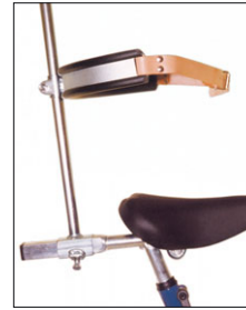
Back brace with strap