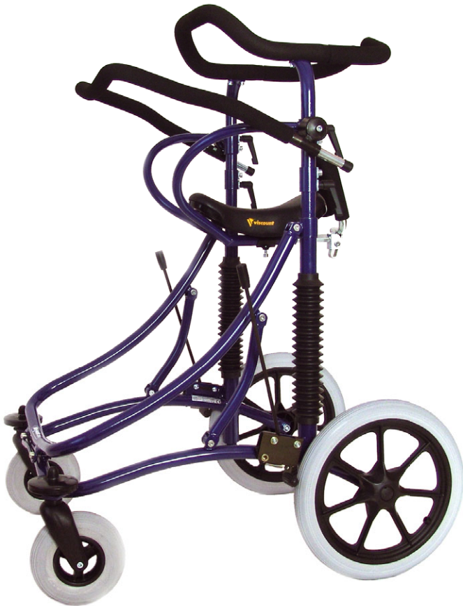
MEYWALK® 2000 comes complete with seat, trunk support, rear stop, handlebar, fender wheels and parking brakes.